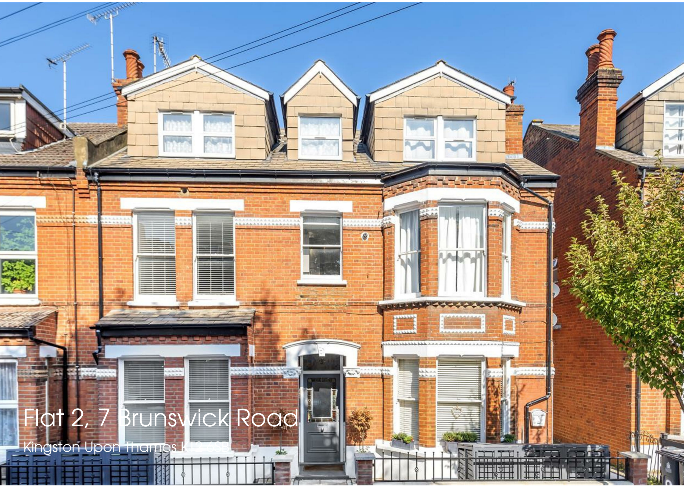
Flat 2, 7 Brunswick Road Kingston Upon Thames KT2 5ED

34 Richmond Road Kingston upon Thames Surrey KT2 5ED www.gibsonlane.co.uk Tel: 020 8546 5444